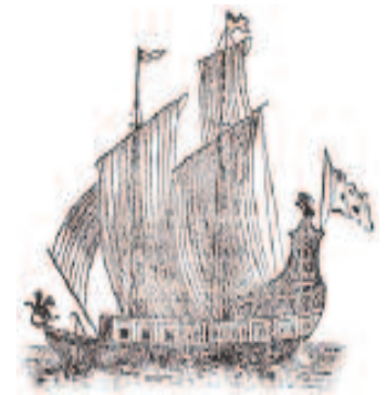
Father Hennepin's description of a 17th century explorer:

Come Join The Explorers in Charlevoix the Beautiful!