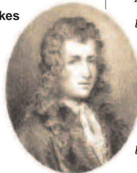
French Explorer Robert Cavalier, Sieur de La Salle